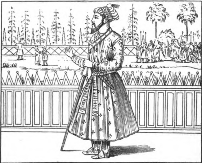
FIG. 2.—The Emperor Sháh Jahán.

was, to assume the chief command, and to face Aureng-Zebe's army. This scheme was admirably adapted to preserve peace, and to arrest the progress of that haughty prince: neither he nor Morad-Bakche would probably have felt disposed to fight against their father: or, if they had ventured upon such a step, their ruin must have been the consequence; for Chah-Jehan was popular among all the Omrahs , and the whole army, including the troops under the two brothers, was enthusiastically attached to his person.