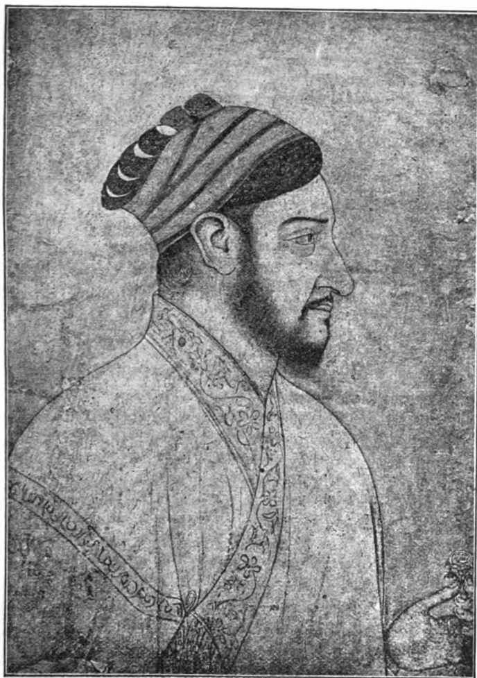
FIG. 1.—Prince Aurangzeb.