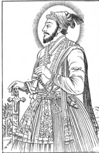
FIG. 3.—Prince Murád Bakhsh.

the night in representing the occurrences in Aureng-Zebe's tent, as perfectly trifling and unimportant: they were present (they pretended), and Morad-Bakche having drunk to excess, had lost his self-possession, and made use of very intemperate language. There was no one upon whom he had not cast injurious reflections, and he had even loaded Aureng-Zebe himself with the foulest abuse. In short, he had grown so quarrelsome and ungovernable, that it became necessary to confine him apart: but in the morning, when recovered from his night's debauch, he would be again set at liberty. In the mean time, large bribes and larger promises were given to all the superior officers; the pay of the whole army was immediately augmented; and, as there were few who had not long foreseen the downfall of Morad-Bakche , it is not surprising that when the day dawned scarcely a trace of the late partial commotion existed. Aureng-Zebe felt that he might venture to shut his brother up in a covered embary , 1 a kind of closed litter in which women are carried on elephants; and in this manner the Prince was conveyed to Dehli, and incarcerated in the ancient citadel of Selim-guer , 2 which is situated in the middle of the river.