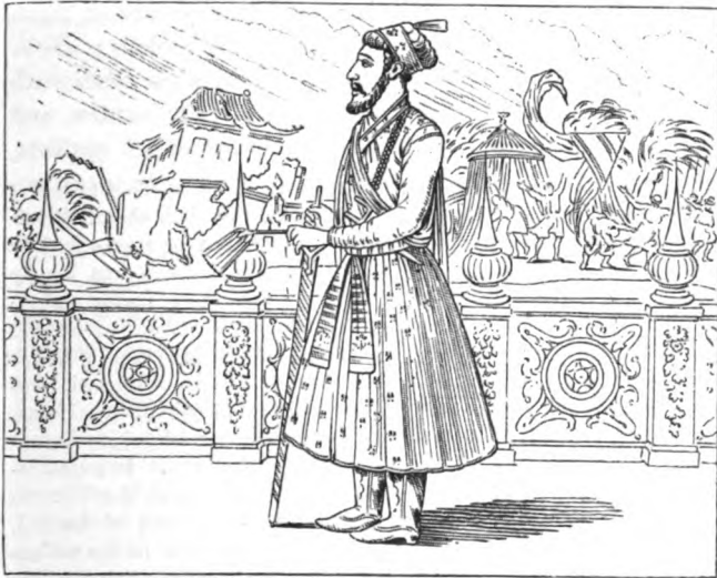
FIG. 6.—The Emperor Álamgir (Aurangzeb).

some considerable present, the two Kans sent ambassadors, with a proffer of their services, and with injunctions to perform the ceremony of the Mobarek : that is, to express in a solemn manner their wishes that his reign might be long and auspicious. Aureng-Zebe knew how to value an offer of service made at the conclusion of a war: he knew the fear of punishment, or the expectation of advantage, had induced the Kans to send their ambassadors. They were received, however, with due form and polite-