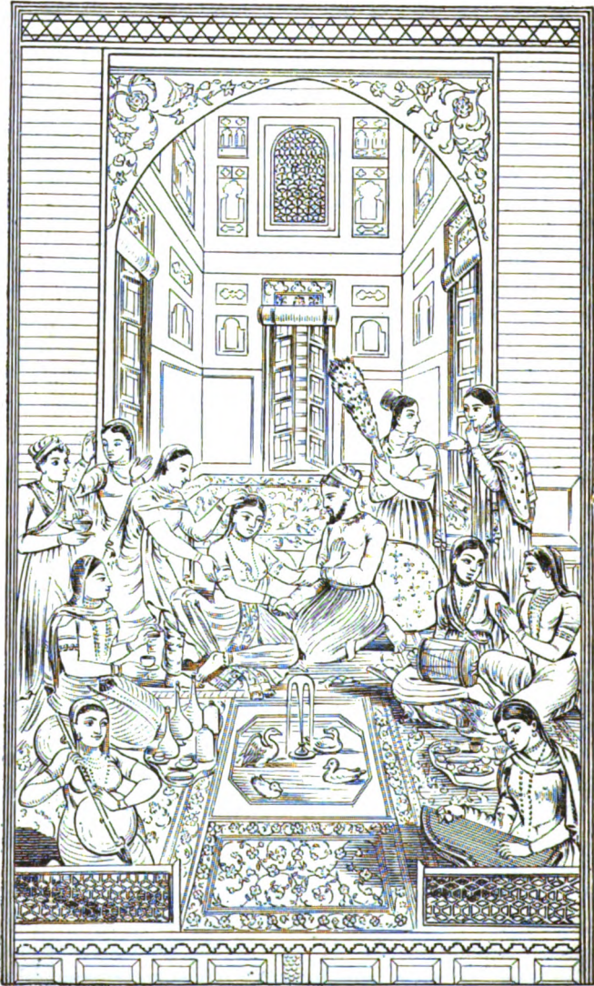
FIG. 7.—Amir Jumla amusing himself in his Zenana.