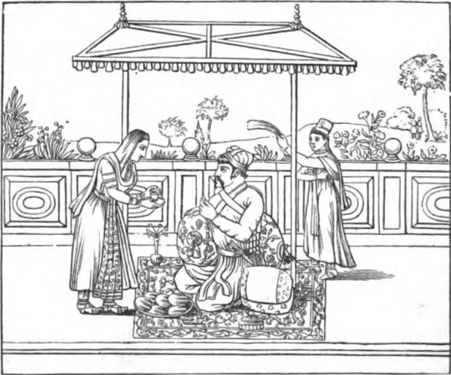
FIG. 4.—Sultan Shujah.

Having thus disposed of his eldest son, Aureng-Zebe advised his second son, Sultan Mazum , not to imitate the lofty and unyielding spirit of his brother. 'The art of reigning,' he told him, 'is so delicate, that a King's jealousy should be awakened by his very shadow. Be wise, or a fate similar to that which has befallen your brother awaits you. Indulge not the fatal delusion that Aureng-Zebe may be treated by his children as was Jehan-Guyre by his son Chah-Jehan ; or that, like the latter, he will permit the sceptre to fall from his hand.'