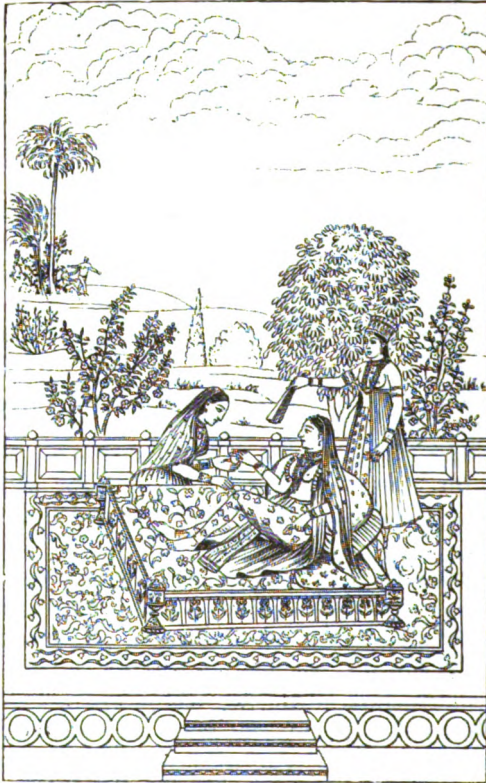
FIG. 11.—The Empress Taj Mahál.

When at the end of the principal walk or terrace, besides the dome that faces you, are discovered two large