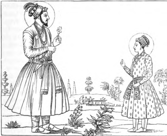
FIG. 5.—Prince Dará Shikoh and his son Sipih r Shikoh.

language. I took my station in one of the most conspicuous parts of the city, in the midst of the largest bazar; was mounted on a good horse, and accompanied by two servants and two intimate friends. From every quarter I heard piercing and distressing shrieks, for the Indian people have a very tender heart; men, women, and children wailing as if some mighty calamity had happened to themselves. Gion-kan rode near the wretched Dara ; and the abusive and indignant cries vociferated