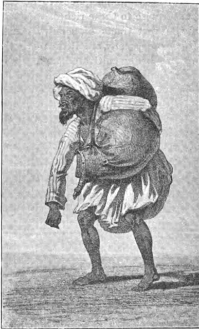
FIG. 9.—'Gunga Din.'

the Mogol marched from Ateck on the Indus to Kaboul ; for the purpose of besieging Kandahar . 1 By stopping the supply of water from the mountains, and preventing its descent into the fields contiguous to the public road, they completely arrested the army on its march, until the